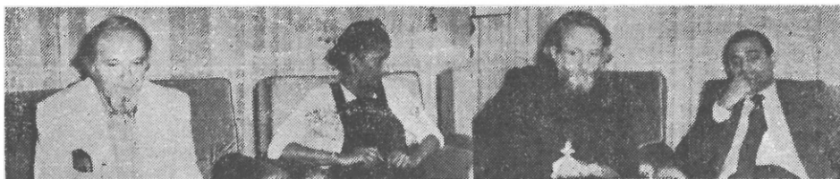
American group in Jerusalem