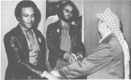
Chairman Arafat with Black-American supporters

This letter is a reply to your column in the Washington Post entitled “A Plea to the Palestinians.”