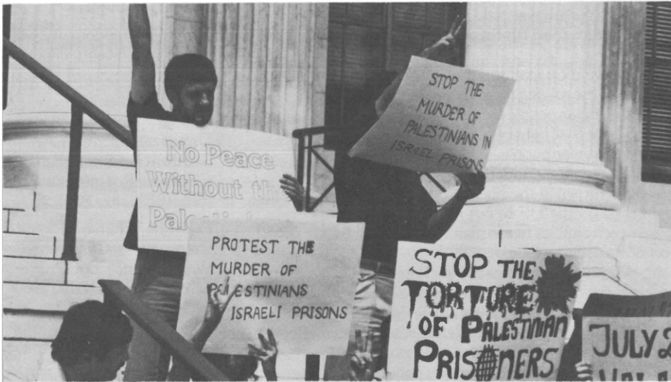
In Support of Palestinian Political Prisoners