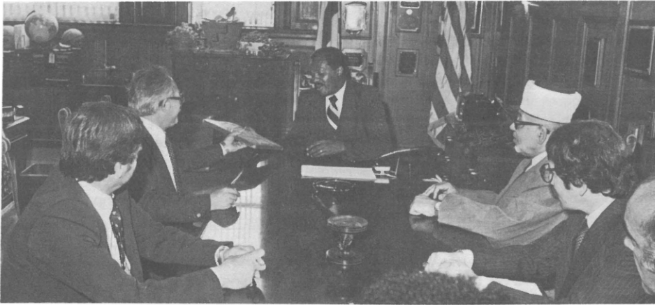
Mayor Marion Barry with Palestinian Mayors