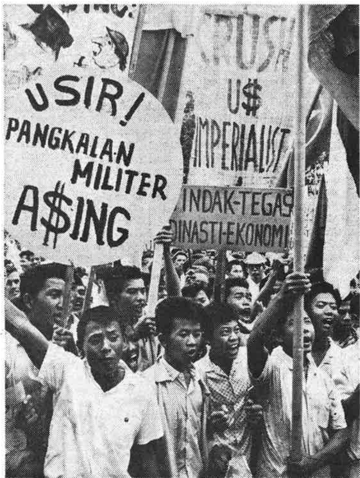
Indonesian students demonstrating against US last month. This is only one of a long series of such actions, where the C.I.A. has tried to arrange counter-revolutions

Further protests on Malcolm's assassination came from throughout Africa.