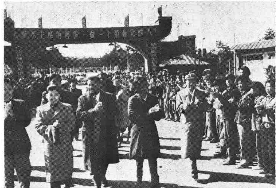
Rob and Mabel Williams being greeted by industrial workers in China.